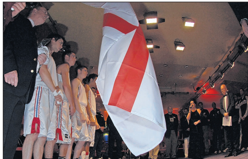
PARADE: Soprano Stella Brading leads the singing of the national anthems